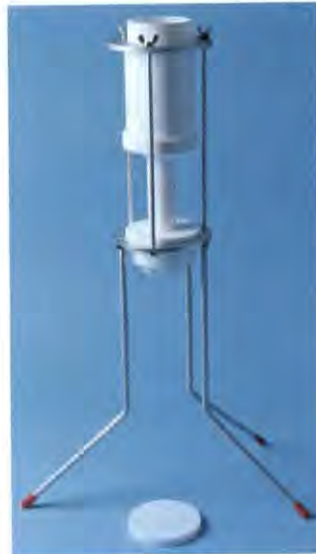
Figure 1: Dekaport Cone Splitter for making replicate water samples. The device, including legs, weighs 8 pounds and is 26.1 inches tall. The splitter without legs is 13.4 inches in height and is constructed entirely of Teflon ® . The legs and supporting frame are anodized aluminum. From top to bottom, the cone splitter consists of a 4-inch diameter upper reservoir, stand pipe to deliver a uniform flow to the splitter cone, splitter cone chamber, and 10 exit ports to which 3/8-inch O.D. Teflon ® tubing can be attached for collecting split samples.

Pollutants with low aqueous solubility, such as dioxins 1 , require additional special attention because they tend to partition preferentially from the dissolved state to a sorbed state on solid surfaces such as sediments and container walls. For low-solubility pollutants, any sampling step that requires transferring a sample from the original collection container to other containers has the potential for introducing quantitation errors because sorbed pollutants are seldom transferred in a consistent manner. Sample transfer difficulties are minimized by pre-rinsing collection and transfer containers and by always using a cone splitter, Figure 1, for splitting a single sample containing sediment into two or more replicate samples.