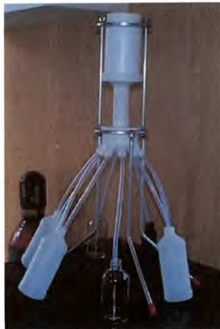
Figure 2: Cone splitter with different kinds of collection containers attached. The three plastic containers are each connected to two outlet ports for collecting larger sample volumes.

Bottles for different analyses (e.g., metals and dioxins) and different sized sample containers with or without preservatives can be connected to the splitter at the same time (see Figure 2).