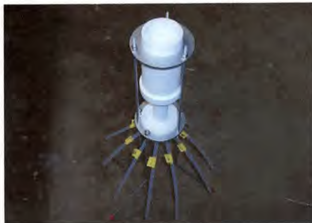
Figure 4: Cone splitter with outlet tubes attached and labeled 1-10.